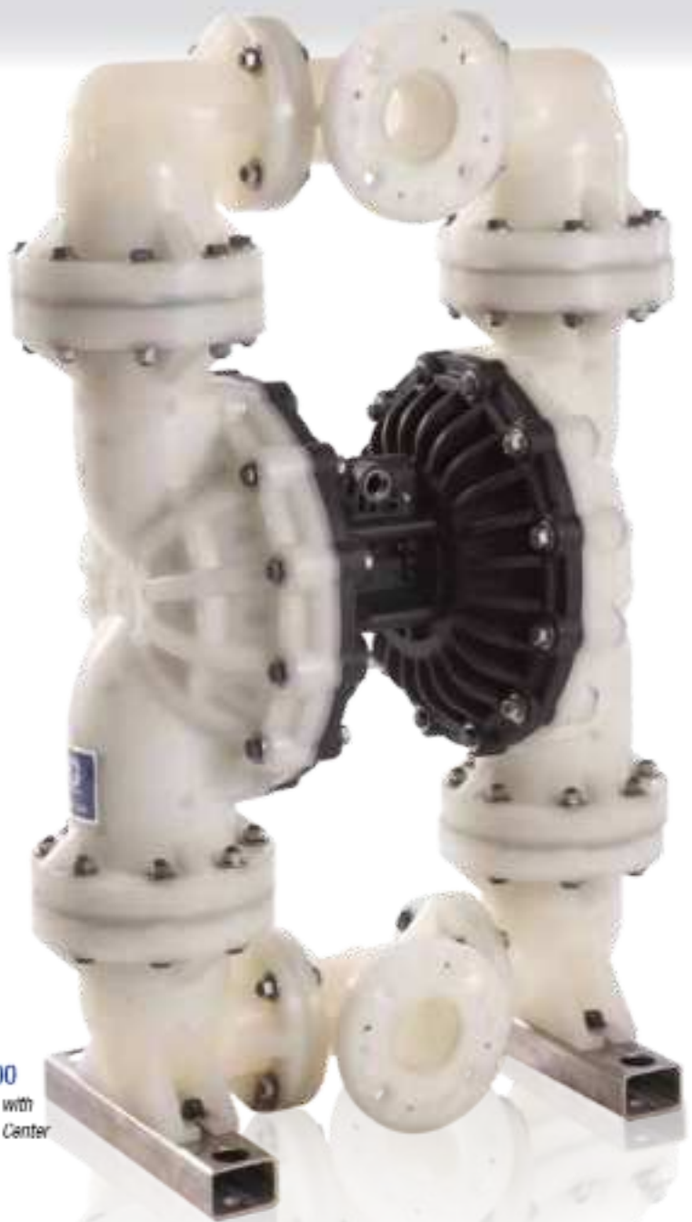
Husky 3300 Polypropylene with Polypropylene Center

DataTrak™ available to prevent pump runaway and track material usage